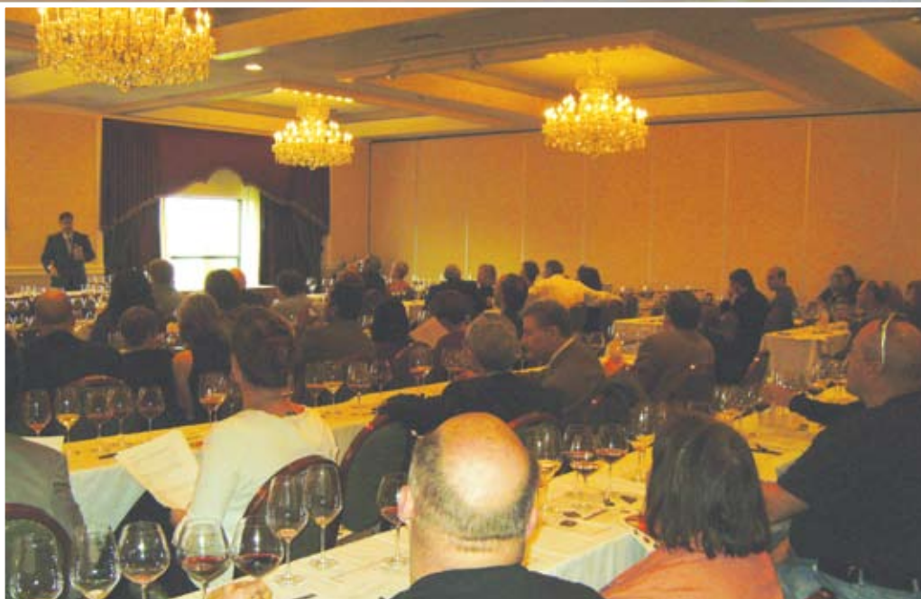
Wine and Chocolate Pairing — The heart healthy types of course!