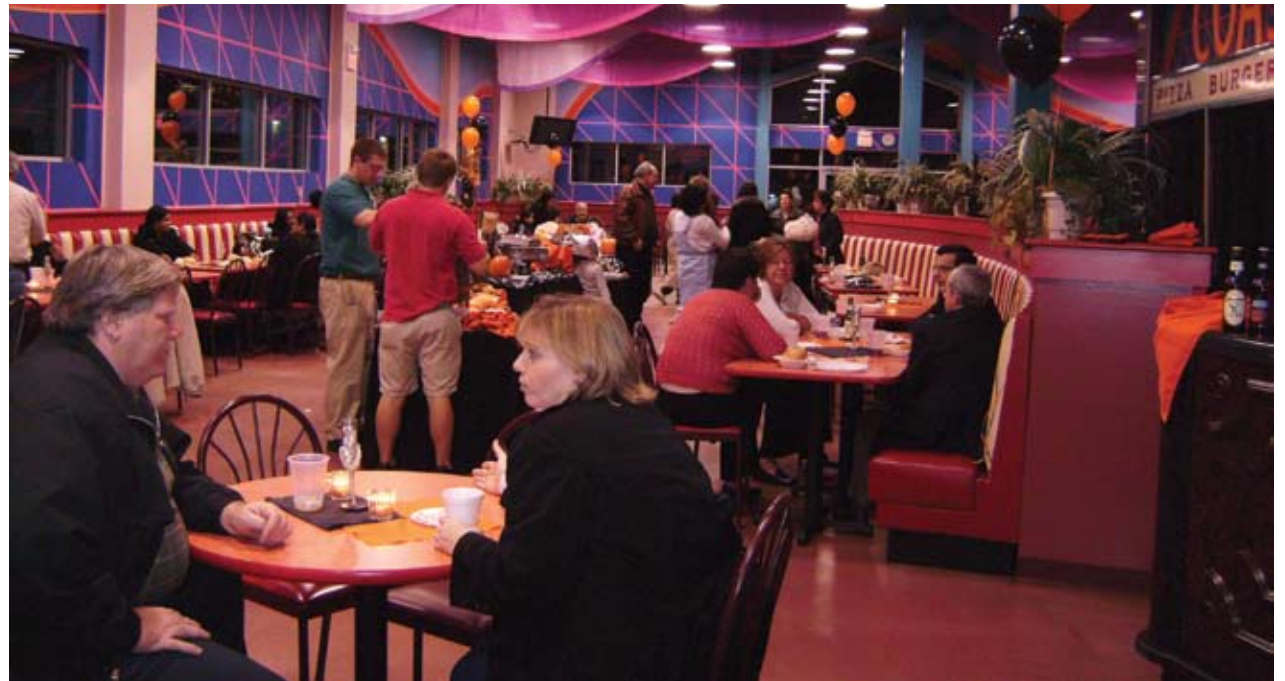
Welcome Reception at Hersheypark